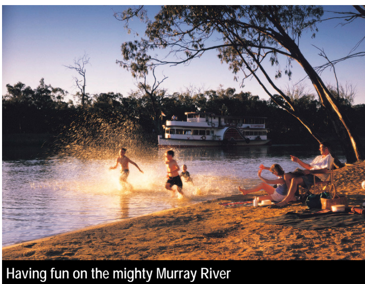
Having fun on the mighty Murray River