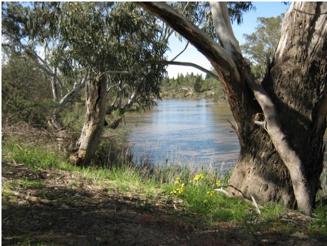
Image: Wimmera River near Horseshoe Bend

Bush camping away from the park campgrounds is permitted in the central and western blocks of the desert.